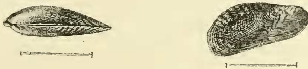
FIG. 6.— Modiola chilkaensis , sp. nov.

Shell trapezoidal, rather inequivalve, the right valve being more convex than the left, thin, pale green, streaked and spotted with reddish purple, both valves marked with concentric lines of growth and radiately sculptured at the extreme anterior side and posteriorly with somewhat irregular costulae; umboes small, not very prominent, very anteriorly situate; dorsal margin sloping,